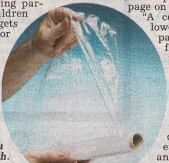
VIRAL STUNT: Clingfilm